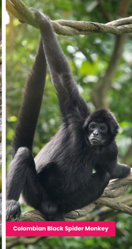
Colombian Black Spider Monkey