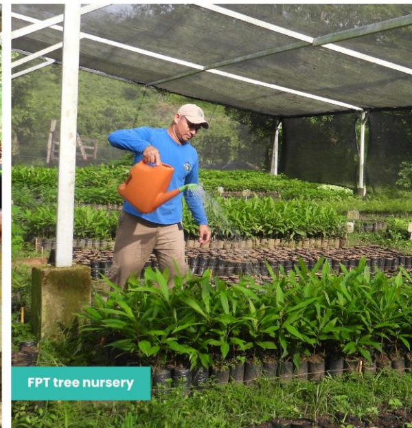
FPT tree nursery