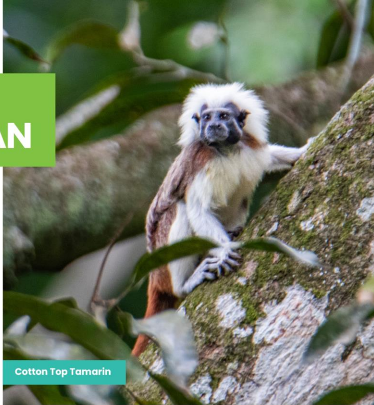
Cotton Top Tamarin

Each year, 1,600 local children learn about titi monkeys and the Tropical Dry Forests.