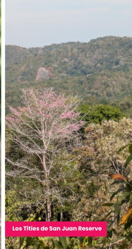
Los Tífiles de San Juan Reserve