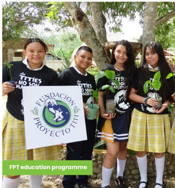
FPT education programme