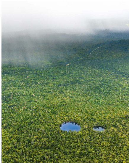
The Belize Maya Forest protects the largest intact forest area remaining in Belize.