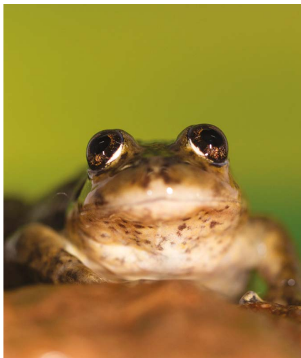
The entire population of the El Rincon Stream Frog is restricted to just a few small streams on the Somuncurá Plateau.