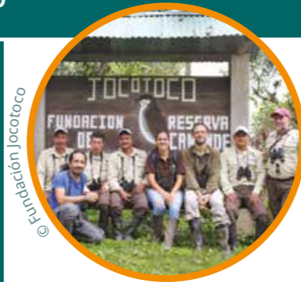
The surge of donations to our #SaveTheChocó appeal in 2020 will help to fund a much greater expansion of the Canandé Reserve than WLT had expected.

Just before the coronavirus pandemic ravaged the world, 2020 also marked our WLT Partners' Symposium in Guatemala, where I was privileged to meet many of the incredible people who make this work happen on the ground. The passion and professionalism of these partners, combined with the passion and generosity of our supporters, gives me enormous hope that together we will continue to grow WLT's impact in 2021, and beyond.