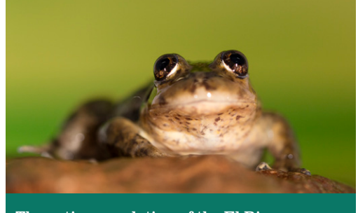
The entire population of the El Rincon Stream Frog is restricted to just a few small streams on the plateau.