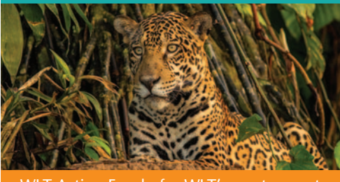
WLT Action Fund - for WLT's most urgent conservation projects.