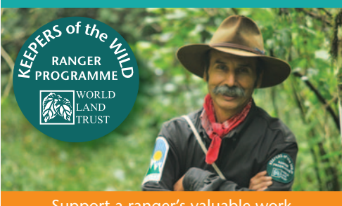
Support a ranger's valuable work protecting land from ongoing threats.