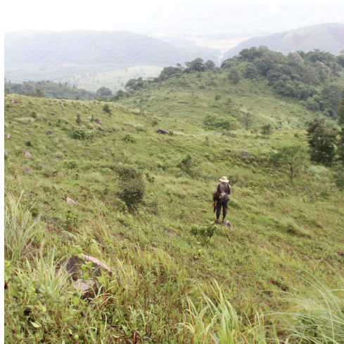
Invasive grasses cover the hills of Huong Ling where rolling forests should flourish.

This is your chance to support a project that will restore a lost ecosystem, safeguard biodiversity, and recreate a healthy environment for local people.