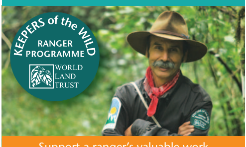
protecting land from ongoing threats.