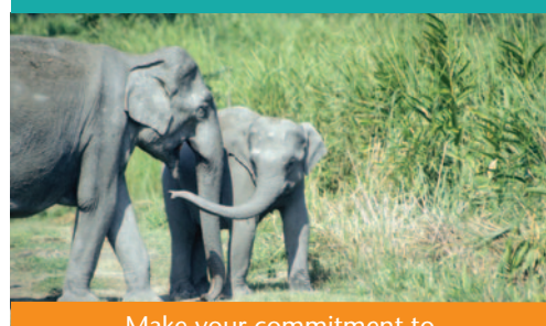
Make your commitment to conservation today (overleaf).

Visit the World Land Trust website for more information on these projects.