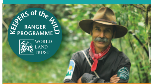
Support a ranger's valuable work protecting land from ongoing threats.