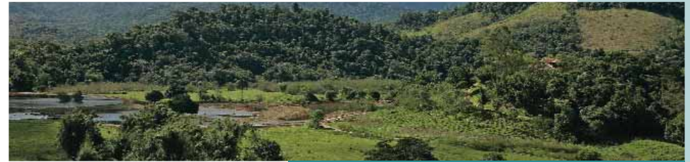
Above: A panoramic view of the Guapi Assu Reserve

The underlying aim behind all the plans for the Guapi Assu Reserve is the effective long term conservation of the site's rich biodiversity and natural beauty. It is, however, not enough to declare an area a reserve and expect that this alone will ensure its protection in the future. Recognising this problem, REGUA is taking a proactive role to raise the profile and support for the reserve through a range of integrated conservation, research, environmental education and community outreach programmes. Working with the local communities, including school children from the surrounding region, and landowners with contiguous forest, the aim is to foster an awareness of the complex beauty and conservation importance of the Mata Atlantica , and promote a sense of pride and ownership in the work at the Guapi Assu Reserve. The 'Young Rangers' for example, undertake research on the reserve and in return for their services they gain knowledge of wildlife management and an insight into working as a ranger, both of which will help their career prospects.