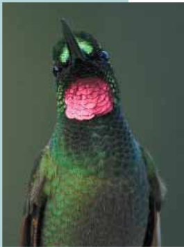
Above: Brazilian Ruby (male) , one of the typical hummingbirds found at higher elevations in the Atlantic Forest.

Woolly Spider Monkey can move safely between protected areas. The reserve area once held a large lowland wetland with rare species of trees, orchids and bromeliads, but this was cut, drained and turned into pasture thirty years ago when it was still a farm. REGUA had successfully restored this special vegetation type and the surrounding 60 hectares of degenerated pasture by the end of 2007. Now the area is flourishing with plants that have naturally regenerated from the existing seed bank, and wildlife such as Caiman and Capybara are returning to the wetland. Over 435 species of birds have been recorded at the reserve with 10 new species to the reserve recorded in 2008 alone: the restored wetlands are clearly attracting more species. Now that the land is wardened and protected REGUA has begun to reintroduce species that had been lost due to hunting in the past. The reintroduction of the Red-billed Curassow began in 2006 and has been extremely successful. Reintroduction of the Black-fronted Piping Guan, began at the end of 2007. It may be feasible to introduce some species of mammals in the future.