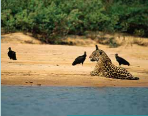
A Jaguar in the Pantanal

Sir David Attenborough, a WLT Patron, spent three months in Paraguay in 1958 on a Zoo Quest Expedition. It remains one of his favourite places and he sends the following message: