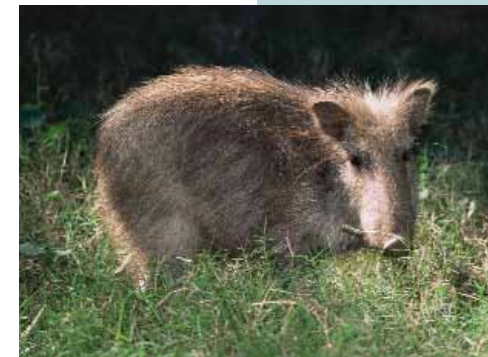
Above: The endangered Chaco Peccary