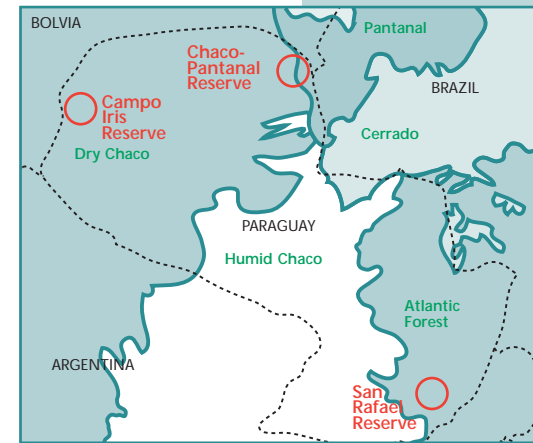
Above: Main habitats are shown in green

But, as with all of Paraguay's unique habitats, the Dry Chaco is threatened, primarily by the spread of agriculture, and in particular the growing market for biofuels and soya.