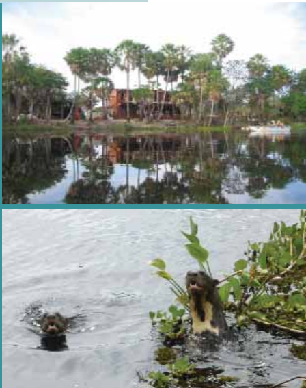
Above: The "Three Giants" Biological Station is located on the Chaco-Pantanal Reserve, on the shore of Rio Negro. This is one of the least explored places on Earth. Giant Otters are regularly seen.

World Land Trust is funding land purchase and protection in three different eco-regions.